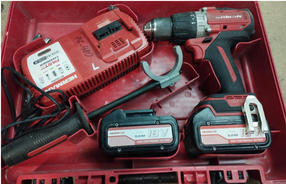
Obr.1 Stav náradia pri prijme