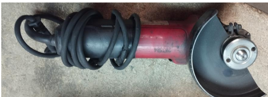
Obr.1 Stav náradia pri príjme